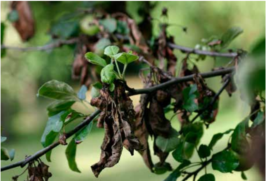
Fireblight infected tree.

Please keep this in mind when using any product. Please follow all label instructions, wear protective clothing, and do not use around children and pets.